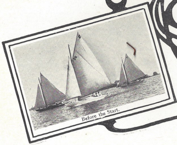
Before the Start.